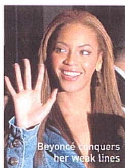
Beyoncé conquers her weak lines